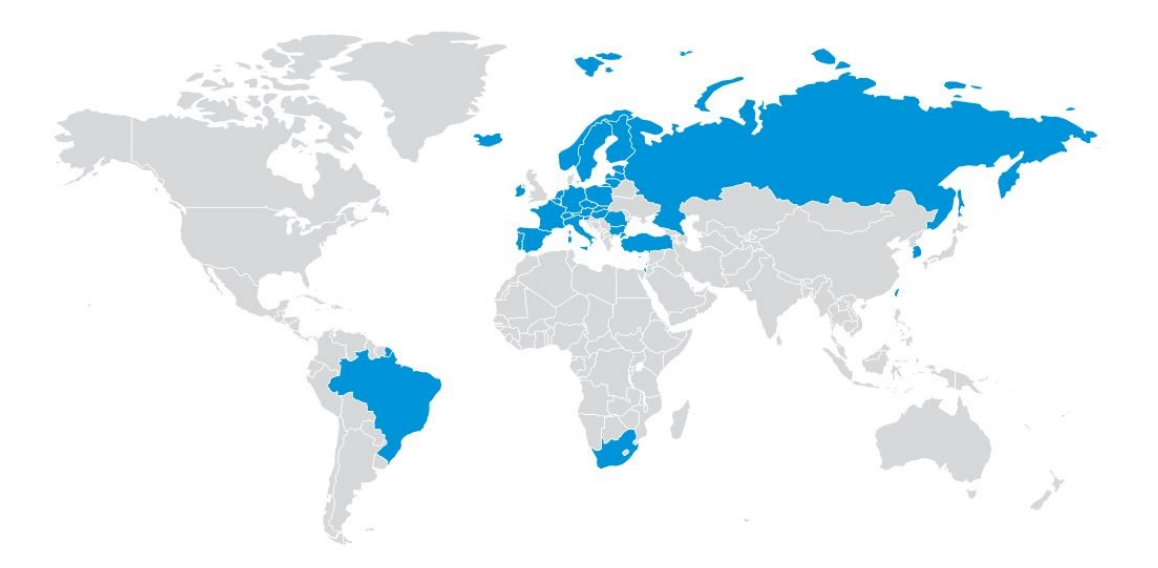
Figure 1: M-ERA.NET 2 participants, see also <a href="https://www.era-learn.eu/network-">https://www.era-learn.eu/network-</a> <a href="mailto:information/networks/m-era-net-2/overview-participants">information/networks/m-era-net-2/overview-participants</a>

M-ERA.NET started in 2012 under the FP7 scheme and continues from 2016 to 2021 under the Horizon 2020 scheme as a network of more than 40 public funding organisations from around 30 different countries, including national, regional and non-European organisations. M-ERA.NET aims to identify further relevant materials research programmes and to establish cooperation with funding organisations from Europe and beyond.